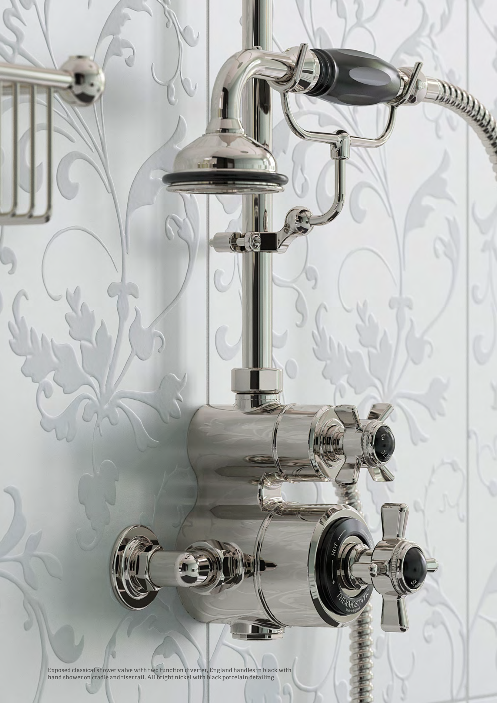
Exposed classical shower valve with two function diverter, England handles in black with hand shower on cradle and riser rail. All bright nickel with black porcelain detailing