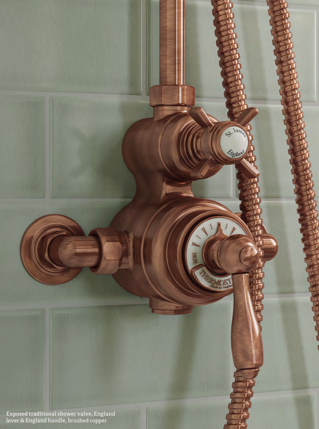
Exposed traditional shower valve, England lever & England handle, brushed copper

The St James Collection was revered from its early days with the iconic design of our traditional thermostatic shower valve; a flagship product of beautiful proportions provides authentic elegance coupled with modern performance.