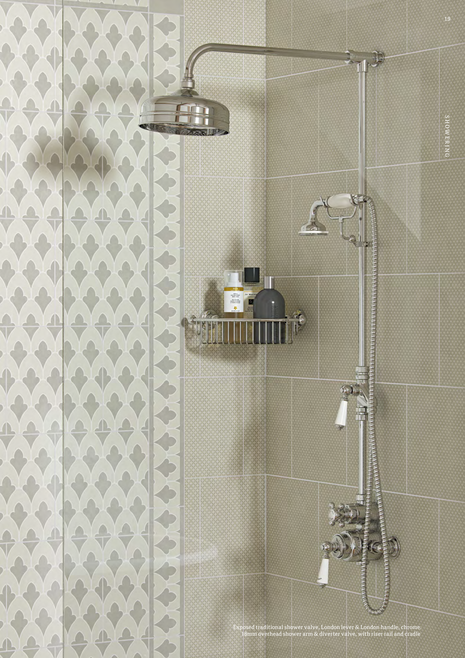
Exposed traditional shower valve, London lever & London handle, chrome. 18mm overhead shower arm & diverter valve, with riser rail and cradle