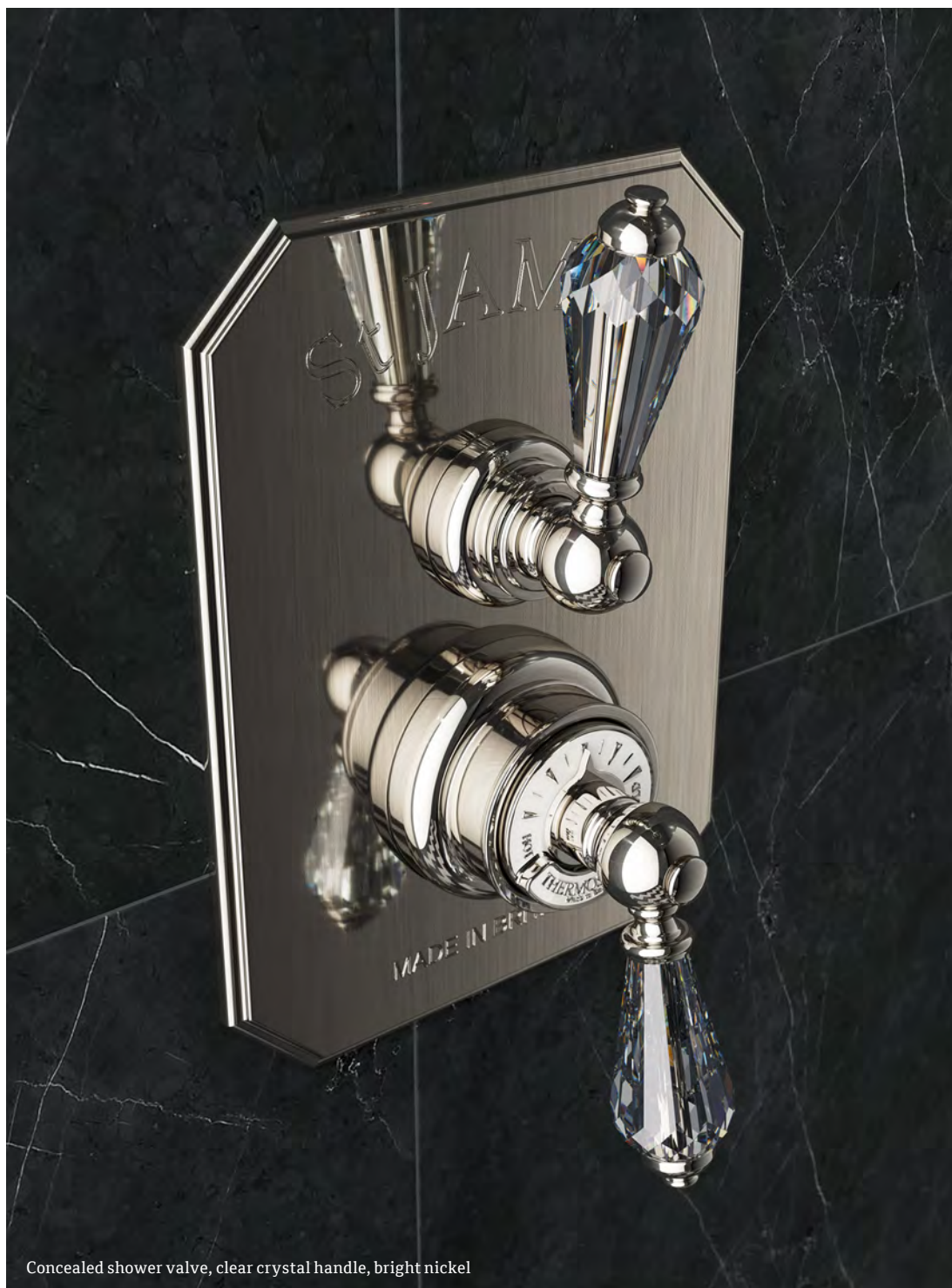
Concealed shower valve, clear crystal handle, bright nickel

With a unique Art Deco inspired angular shape providing a backdrop to our Crystal Edition handles, to the classic plate shape that elegantly showcases all our porcelain and metal handle options, there is a design that will delight you.