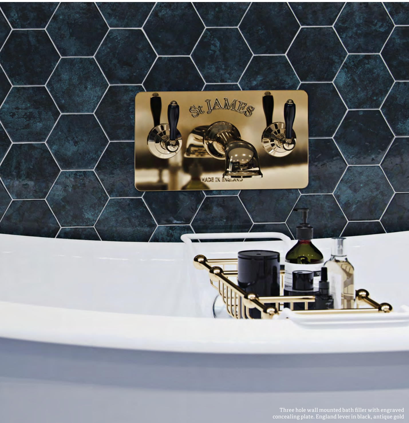
Three hole wall mounted bath filler with engraved concealing plate. England lever in black, antique gold