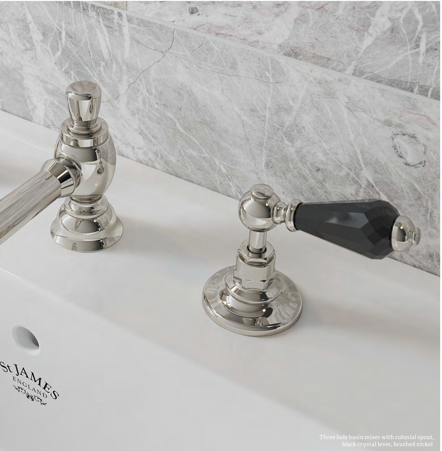
Three hole basin mixer with colonial spout, black crystal lever, brushed nickel