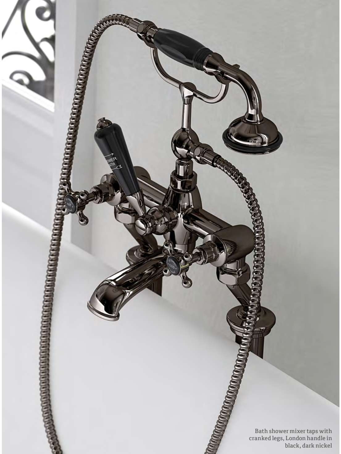
Bath shower mixer taps with cranked legs, London handle in black, dark nickel

Our bath shower mixer taps are available with a choice of mounting options to make the end result truly exquisite.