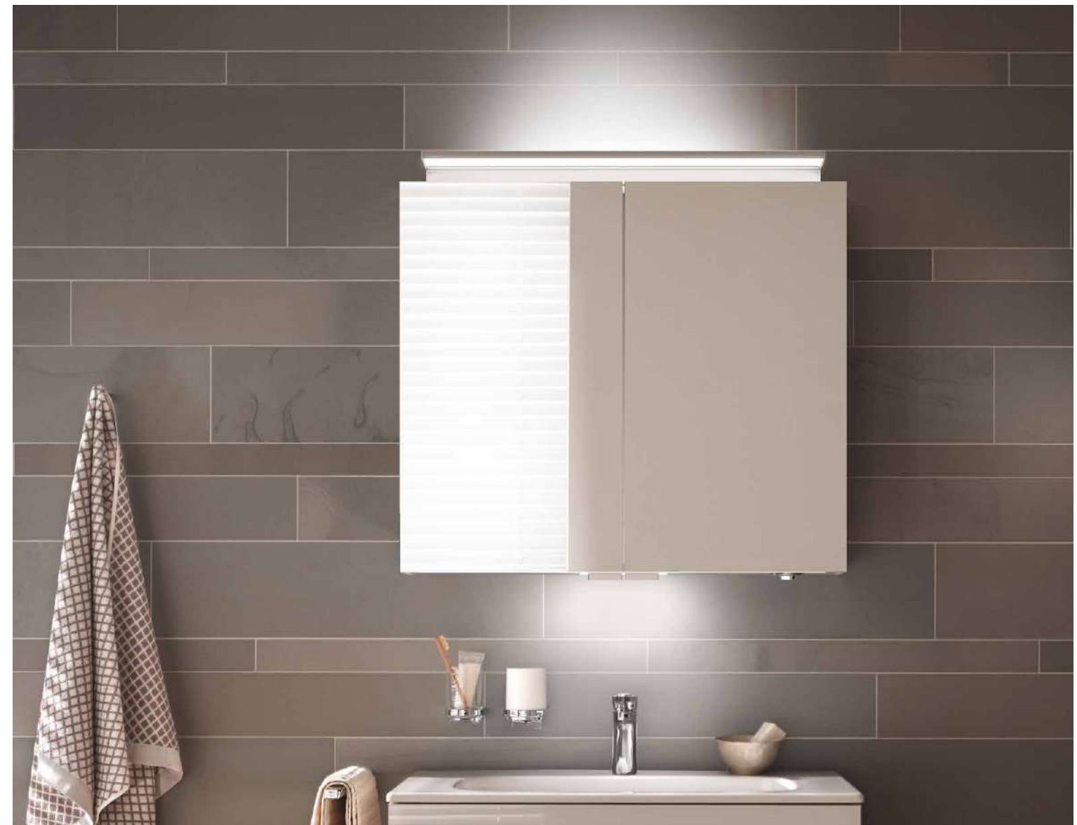
Art.-Nr. 03507380400 Neuheiten Spiegelschränke und Lichtspiegel, englisch, 12/16