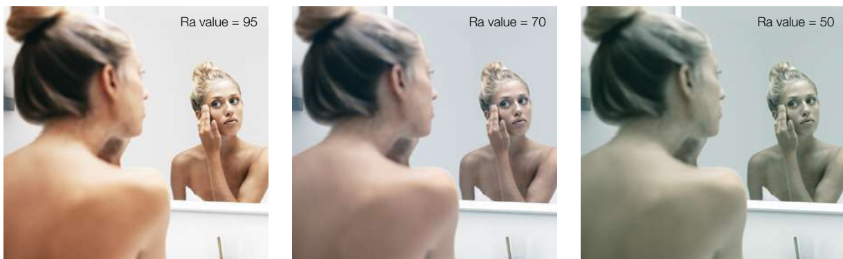
On the photos above, you can clearly see the difference in colour reproduction with a Ra value of 95, 70 and 50, respectively.

If you buy your lighting from Dansani, you do not need to worry about quality and colours of the light. Our LED light diodes are sorted applying high quality levels*, that ensures that all LEDs in your lamps emit a homogeneous light and offer the same correct colour reproduction, no matter the lamp model and position.