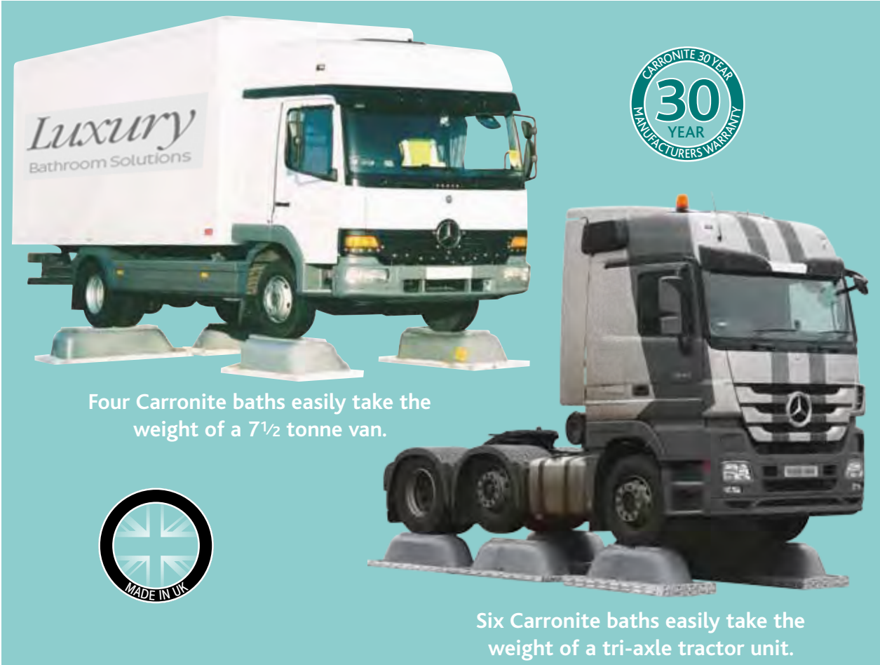
Four Carronite baths easily take the weight of a 7½ tonne van.

They will retain heat for approximately 20 minutes longer than a standard acrylic bath. This is based on a starting temperature of 55 degrees Celsius and reducing to 45 degrees Celsius.