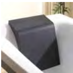
Optional headrest available on some baths - look at the features boxes